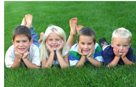
Don't forget the kids!!!